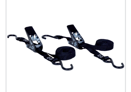
Lashing with narrow strap, 2.0 m (2 pcs) Part No: 11722