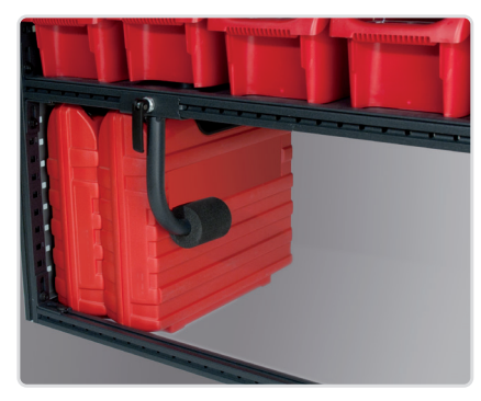
Load stop Part No: 50250-03