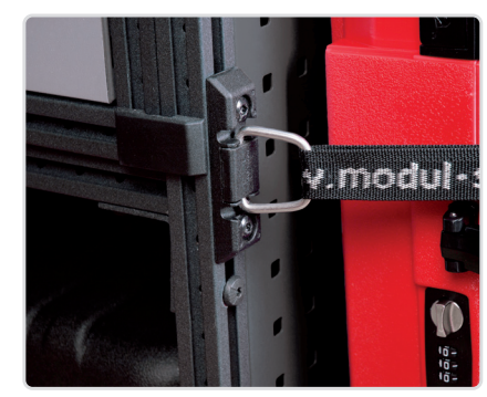
Lashing eyelet Part No: 50025-03