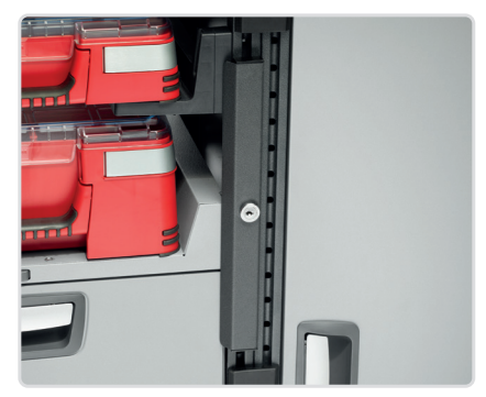
Modul-Lock Part No: 50211-03 (cam lock) Part No: 50212-03 (padlock)