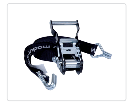
Lashing with ratchet, 4.5 m Part No: 11716

Modul-Box 162 x 324 mm, Part No: 10480-03 Modul-Box 162 x 486 mm, Part No: 10481-03 Divider, Width 162 mm, Part No: 10482-03 Window, Width 162 mm, Part No: 10483-03