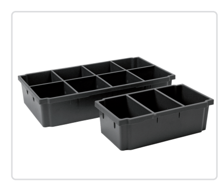
Insert for drawers For 108 mm high drawer, Part No: 10530-03<sup>*</sup> For 108 mm high drawer, Part No: 10533-03<sup>**</sup> For 162/216 mm high drawer, Part No: 10535-03<sup>***</sup>

*162 mm length, 324 mm depth, **324 mm length, 486 mm depth, ***324 mm length, 324 mm depth.