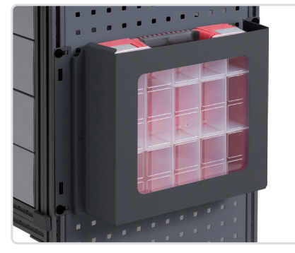
Storage holder for Mobil-Box Part No: 50230-03