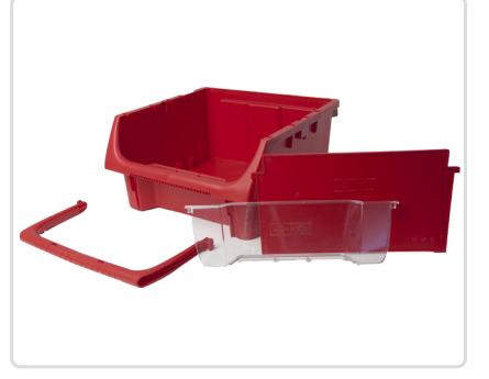
Modul-Box 324 x 324 mm, Part No: 10487-03 Divider, width 324 mm, Part No: 10488-03 Window, width 324 mm, Part No: 10489-03 Handle, width 324 mm, Part No: 10490-03