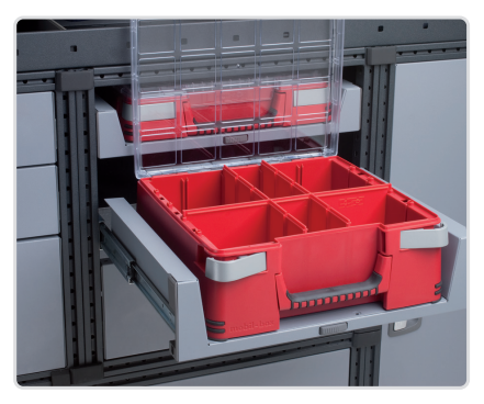
Mobil-Box Part No: 10566, width 486 mm (low) Part No: 10563, width 486 mm (high)