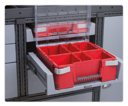
Mobil-Box Part No: 10566, width 486 mm (low) Part No: 10563, width 486 mm (high)