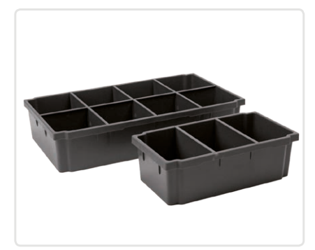
Insert for drawers For 108 mm high drawer, Part No: 10530-03* For 108 mm high drawer, Part No: 10533-03** For 162/216 mm high drawer, Part No: 10535-03***

*162 mm length, 324 mm depth, **324 mm length, 486 mm depth, ***324 mm length, 324 mm depth.