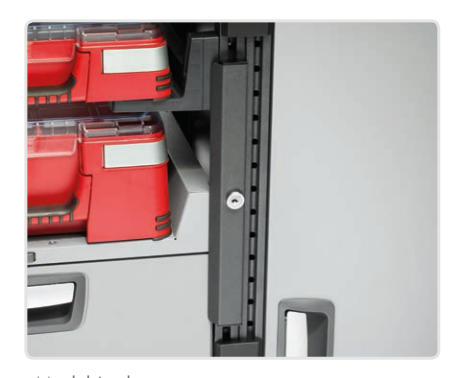
Modul-Lock Part No: 50211-03 (cam lock) Part No: 50212-03 (padlock)