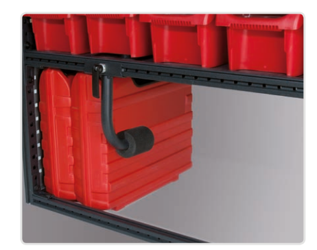
Load stop Part No: 50250-03