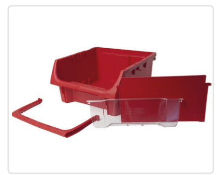
Modul-Box 324 x 324 mm, Part No: 10487-03 Divider, width 324 mm, Part No: 10488-03 Window, width 324 mm, Part No: 10489-03 Handle, width 324 mm, Part No: 10490-03