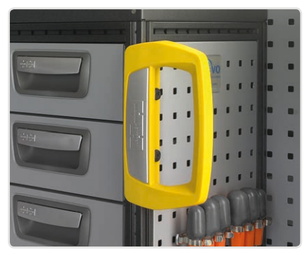
Grab handle Part No: 50014-03