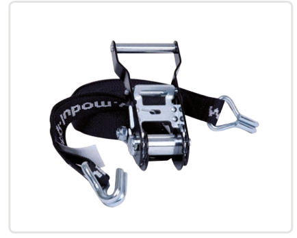
Lashing with ratchet, 4.5 m Part No: 11716