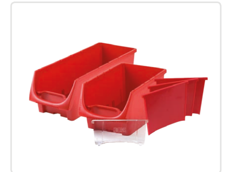
Modul-Box 162 x 324 mm, Part No: 10480-03 Modul-Box 162 x 486 mm, Part No: 10481-03 Divider, Width 162 mm, Part No: 10482-03 Window, Width 162 mm, Part No: 10483-03