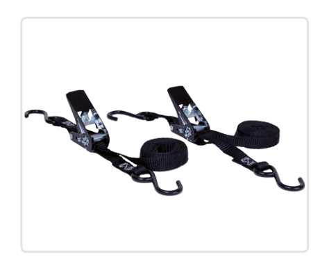
Lashing with narrow strap, 2.0 m (2 pcs) Part No: 11722