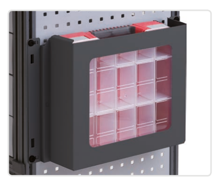
Storage holder for Mobil-Box Part No: 50230-03