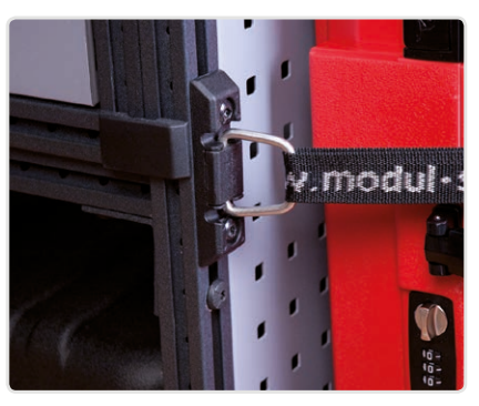
Lashing eyelet Part No: 50025-03